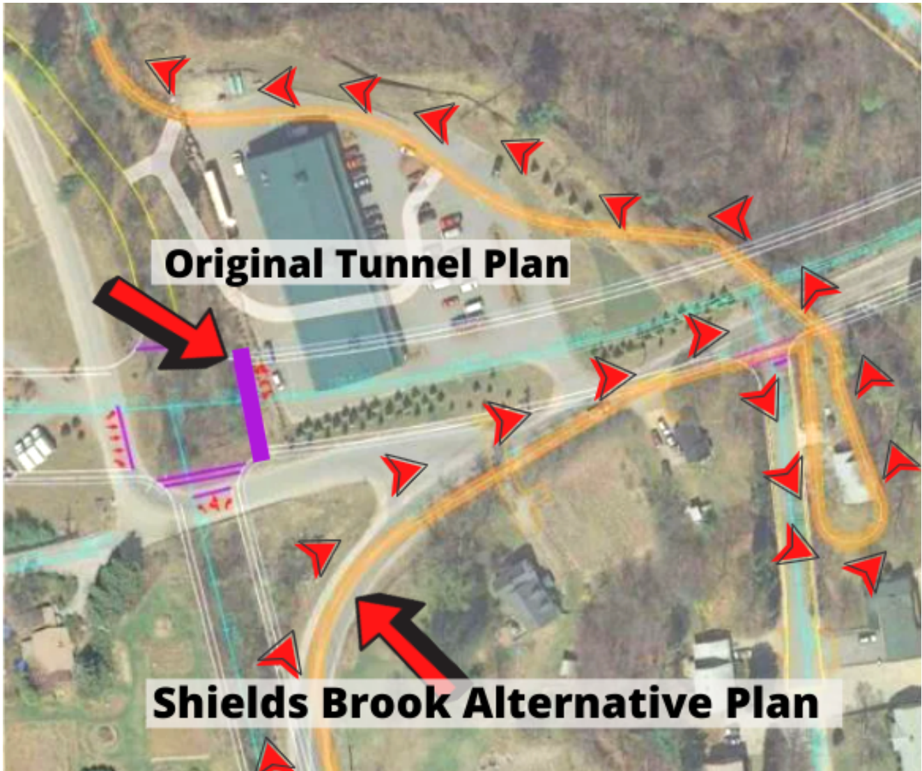
Originally proposed tunnel placement (in purple) and the revised Shields Brook Alternative plan (highlighted with small red arrows), which rail trail advocates say resembles a mile-long string of spaghetti.

DERRY, NH – Transportation officials changed the plans for a section of rail trail to be built through a new highway ramp in Derry, from a straightforward tunnel to a circuitous “spaghetti-shaped” detour, that rail trail advocates are calling unsafe and unnecessary.