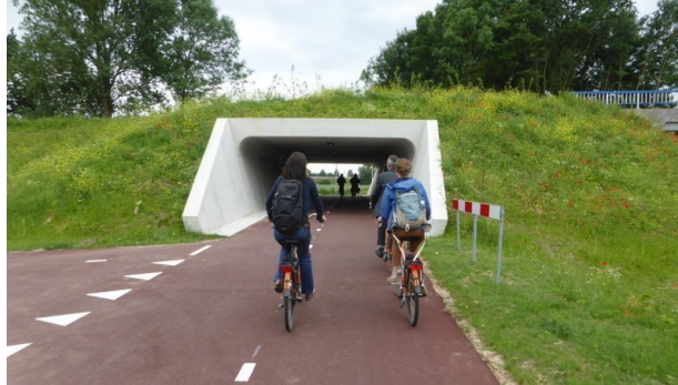
Typical tunnel design:

Which trail design would you feel more comfortable and safer to use, a tunnel or the alternative?