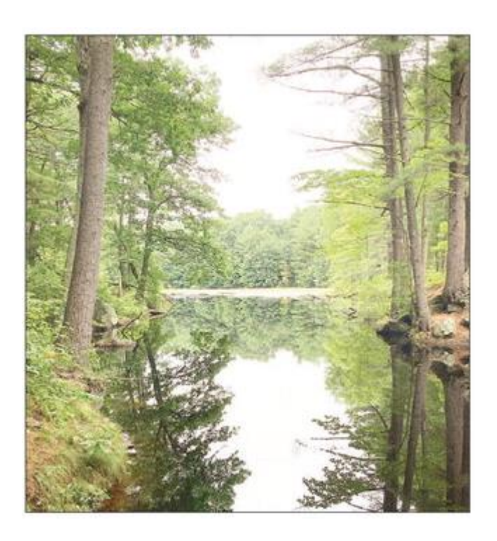
A variety of hiking trails give recreationists quick access to the surrounding area. JILL ARMSTRONG